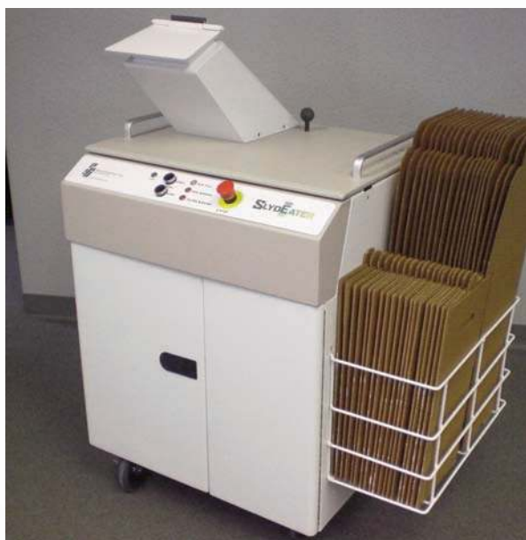
Compact, portable Design

Other handy features of the SlydEater include easy-to-understand indicator lights and a plug-in-the-wall 6-foot cord (110V). Roll-away casters and a narrow 26” wide cabinet allow the SlydEater to be moved room-to-room or placed out of the way when not in use.