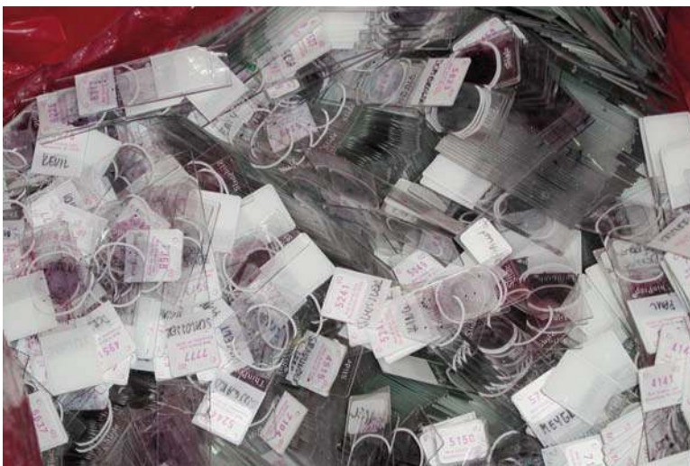
Raw materials before crushing