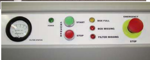
Easy to use Controls & Indicator Lights