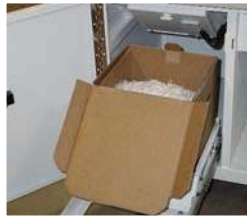
Remove crushed glass with the slide-out drawer